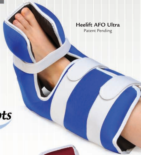
Heelift AFO Ultra Patent Pending