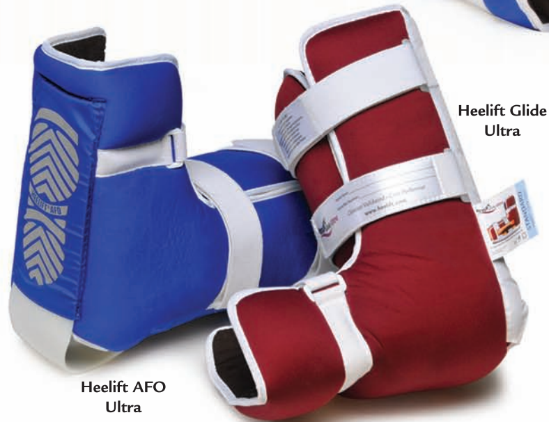
Heelift AFO Ultra

ULTRA PERFORMANCE • ULTRA COMPLIANCE • ULTRA PREVENTION