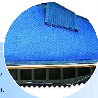
Cutaway diagram illustrates how air sole design reduces impact.

GaitKeeper Cast Shoe with cushioned air sole design prevents excessive walking cast wear and reduces impact loading of the injured leg. An enhanced rocker bottom permits a more natural gait while the flexible sole, designed with 45 pockets of air, delivers superior comfort for the cast wearer.